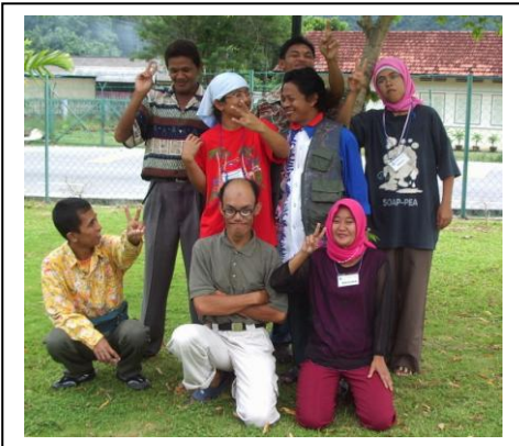
Members of Mutiara Voice Club

Everyone has a river in life they need to cross. Some will face physical barriers, others mental, neither is easy. All will need help, yet they must still cross the river in their own way.