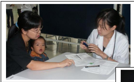
Consulting with Medical officer

With numerous requests from parents and families, ACS organised this one stop disability registration drive with manpower assistance from Golden Key Club student members of USM on November 28 th . This one day event brought three government departments, i.e. Welfare Department, Education Department and Health Department together and enabled the registration of 57 people with Welfare and 27 with Special Education Department. Many thanks to the officers, medical doctors and volunteers present.