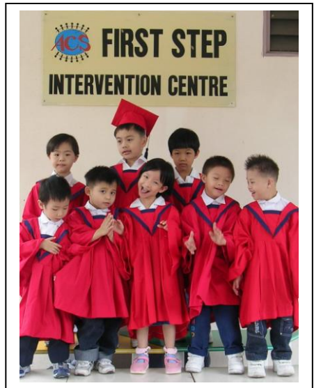
Class of 2005

In collaboration with the Lions Club of George Town, a one-day eye and medical check-up was organised and held at the grounds of ACS Stepping Stone on September 24 th . About 68 people from the local community which included many senior citizens turned up for the medical check-up. We are glad to be in partnership with the Lions Club and appreciate the voluntary medical services provided by the Penang General Hospital.