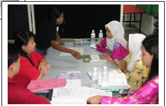
Registering with Welfare Dept