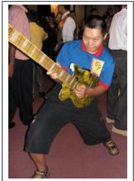
Our own Elvis Presley in action.