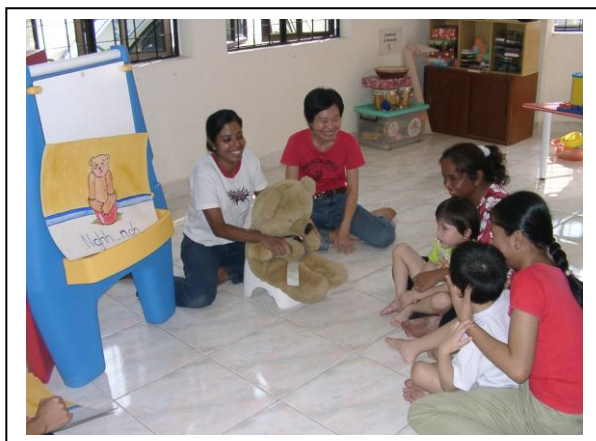
Story Telling during Group Session

First Step Centre aims to adopt this model of approach in our programme for the 54 babies and kids.