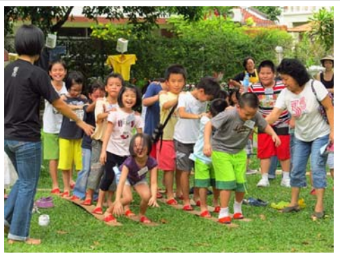
Getting ready for the Caterpillar Race

It was a fun-filled afternoon for 120 children. We had 25 fun stations and children were issued "passports" for them to collect their stamps after participating in each station. This is to ensure that they do not miss out on any of the activity stations.